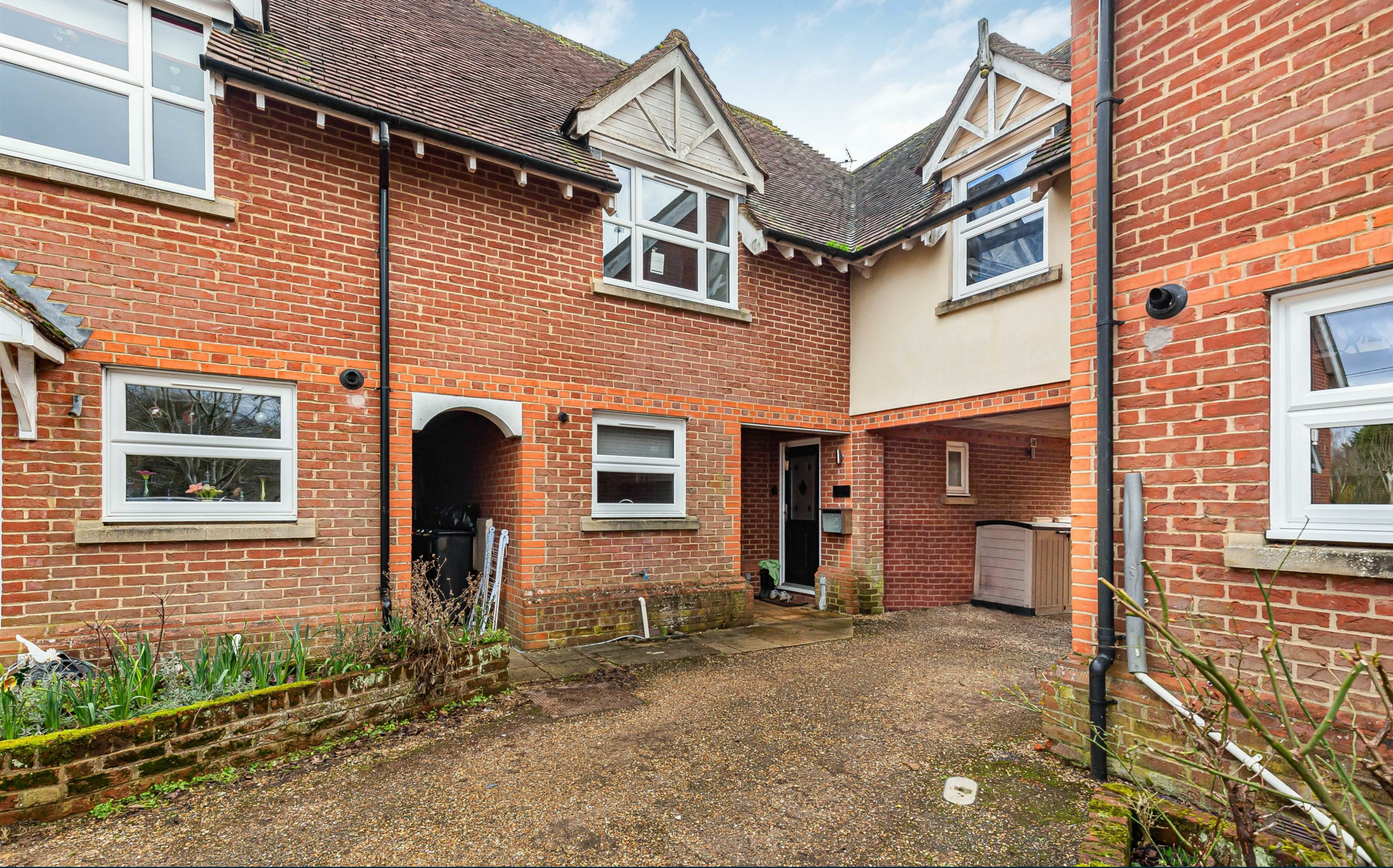
Claywall Cottages, Steeple Bumpstead, CB9 7BZ